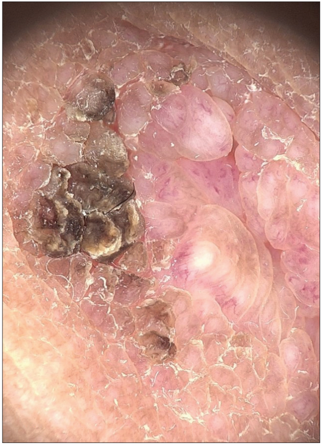
Figure 1c: Dermoscopy of HNA shows thickened brownish structureless areas, tiny scales, papillomatous surface and serpentine and branching vessels (polarized dermoscopy, ×20 magnification)

except for slightly elevated levels of dehydroepiandrosterone sulphate (455 µg/dL (normal range: 148–407)). Histopathological examination of the hyperkeratotic nipple lesion revealed basket-wave orthokeratosis and verruca-like filiform papillomatosis, consistent with the diagnosis of hyperkeratotic nipple areola [Figure 1e]. These findings correspond to brownish structureless areas and papillomatous surfaces on dermoscopy. Additionally, we observed anastomosing acanthosis and basal hyperpigmentation within the epidermis. Sub-epidermal connective tissue showed slight fibrosis. There was no cytological atypia in the epidermal cells. We considered epidermal nevus, acanthosis nigricans and seborrheic keratosis as the differentials, which were ruled out by histology. We started lactic acid treatment as the patient was concerned about cosmetic appearance. However, she refused any further diagnostic procedure and treatment for the supernumerary nipple and is currently under follow-up.