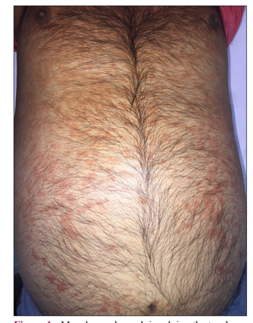
Figure 1: Maculopapular rash involving the trunk

One month after the episode, keeping in view the essential nature of chemotherapy and "unlikely" causality as per algorithm for assessment of drug causality in epidermal necrolysis score, temozolomide was restarted at a dose of 75 mg/m² with close monitoring, while prednisolone 30 mg/day was continued. One week after the rechallenge, the patient again developed facial oedema and maculopapular rash. Repeat investigations showed elevated leucocyte count of 14,320 cells/mm³ with lymphopenia (845 cells/mm³,