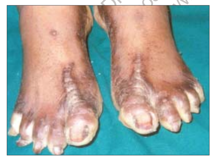
Figure 3: Ketatotic plaques on the dorsa of the feet

hyperkeratosis, parakeratosis, increased granular layer and papillomatosis. X-ray of both hands showed acral osteolysis. Audiometry revealed hearing in both ears