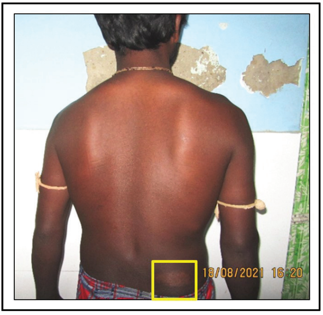
Figure 1a: A 36-year old male with an isolated macular hypoesthetic patch on lower right back

Visceral leishmaniasis, or kala-azar, is caused by the kinetoplastid parasite Leishmania donovani and its dermal sequel, post kala-azar dermal leishmaniasis appears after apparent cure from visceral leishmaniasis. Post kala-azar dermal leishmaniasis (PKDL) in South Asia occurs in approximately 10% of cases with a lag period following visceral leishmaniasis that ranges from 2 to 10 years.<sup>1</sup> PKDL presents with either macular lesions or a combination of papules, nodules and macules, termed polymorphic. In visceral leishmaniasis endemic areas, cases of leprosy or Hansen's disease caused by Mycobacterium leprae can present with similar macular or nodular lesions, along with nerve thickening and hypoesthesia, thus posing a diagnostic dilemma.<sup>2</sup> As per the World Health Organization algorithm for diagnosis of post kala-azar dermal leishmaniasis, the criteria include a history of visceral leishmaniasis,