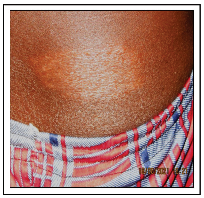
Figure 1b: Magnified view of the macular lesion on lower right back

During an active field survey and medical camp conducted in Harirampur block, South Dinajpur district, West Bengal, a 36-year-old male presented with a macular hypoesthetic patch on the lower right side of back. The lesion was present for eight years along with ulnar nerve thickening [Figures 1a and b]. At presentation, the patient had no fever, hepatosplenomegaly or lymphadenopathy, but gave a history of visceral leishmaniasis 32 years ago for which he received sodium antimony gluconate.