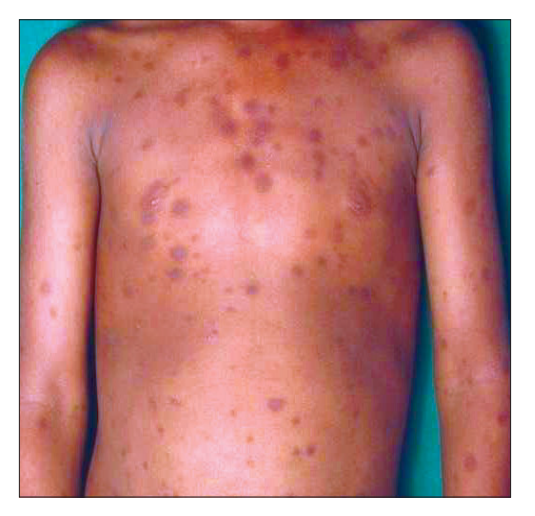
Figure 1: Numerous pigmented macules on anterior trunk and upper limbs