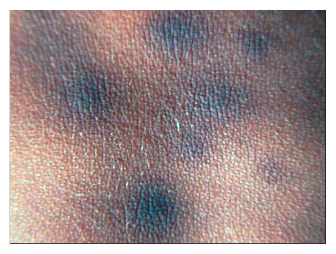
Figure 2: Pigmented velvety macules on the posterior trunk

that are commonly considered in the differential diagnoses, namely, urticaria pigmentosa, lichen planus pigmentosus and erythema dyschromicum perstans. Urticaria pigmentosa, like IEMP, has prominent pigmentation of the basal layer of the epidermis but has in addition, numerous mast cells in the upper dermis that are diagnostic.