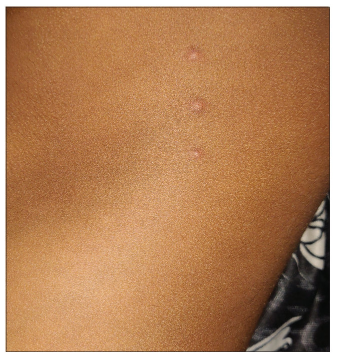
Figure 4: "Breakfast, lunch and dinner sign" in bed bug infestation