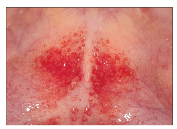
Figure 7: Erythematous papules with pale center (doughnut sign) in Group A streptococcal pharyngitis

soles and fingers in infective endocarditis are known as Janeway lesions. ^{\rm 23}