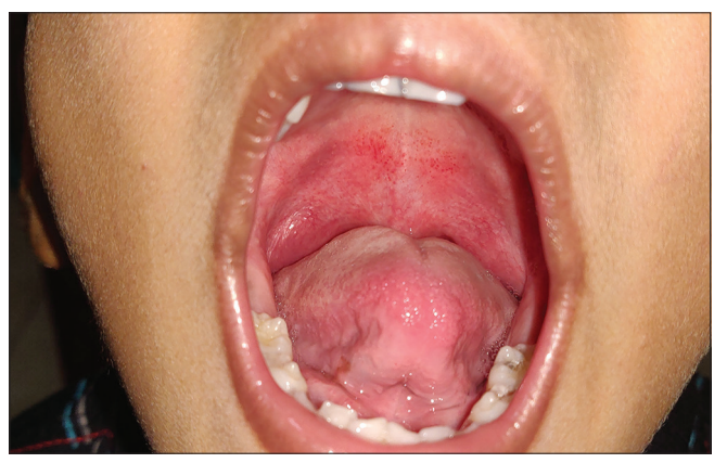
Figure 8: Forscheimer's sign in rubella

cellulitis because the pinna lacks deeper subcutaneous tissue. This is known as Milian's ear sign.<sup>27</sup>