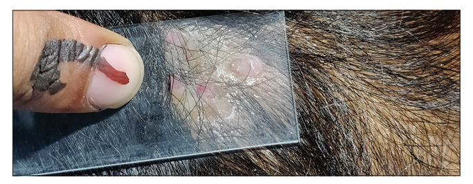
Figure 1: Apple jelly sign on diascopy in lupus vulgaris

4. Breakfast, lunch and dinner sign: The bites of bed bugs ( Cimex lectularius ) usually follow a linear pathway in a group of three to five blood meals and