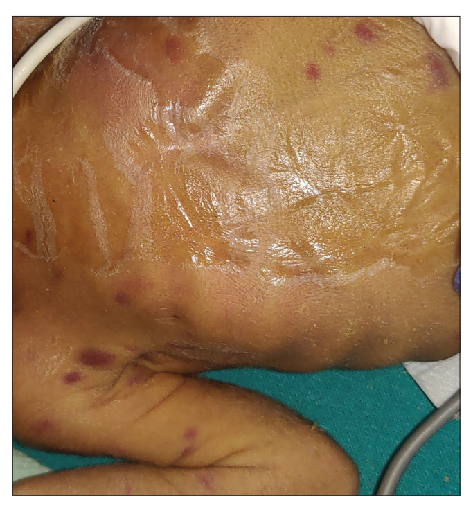
Figure 2: Blueberry muffin sign in congenital rubella

How to cite this article: Amrani A, Sil A, Das A. Cutaneous signs in infectious diseases. Indian J Dermatol Venereol Leprol 2022;88:569-75.