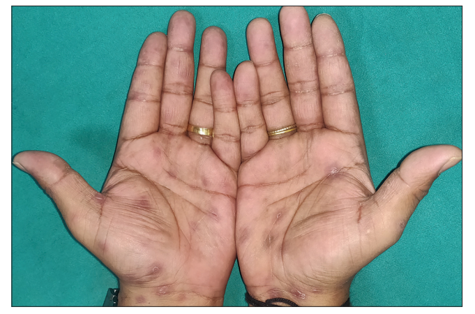
Figure 11: Papular lesion on palms of patients with secondary syphilis which elicit tenderness on applying pressure (Buschke-Ollendorff sign)