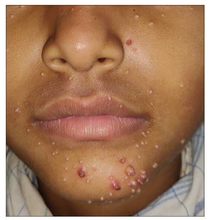
Figure 3: BOTE sign in molluscum contagiosum