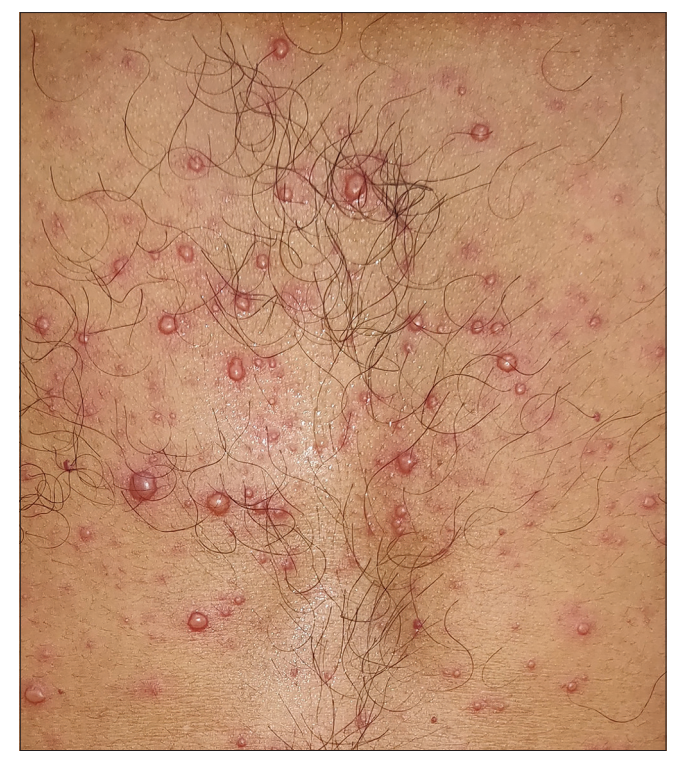
Figure 6: Dew drop on rose petal appearance seen in varicella