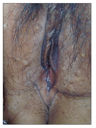
Figure 1: Multiple cystic papulonodules of varying sizes on the vulva