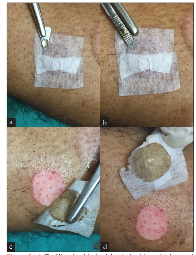
Figures 2a-d: The blister is pricked and detached and its graft is harvested using blunt forceps

flat forceps without graft loss in the margin [Figures 2a-d]. After harvesting, the graft remained in a dome-shaped, uncurled and immediately recognisable surface. Splinting the graft with tape allows it to be identified and sliced into any shape or size and easily transported to the recipient location [Figures 3a and b]. Patching or splinting the blister before harvesting the graft thereby addresses numerous surgical issues associated with blister grafting. In addition to this technique, a few customised hemispherical/circular adhesive tapes can be used for splinting the blister roof before its