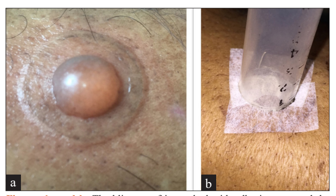
Figures 1a and b: The blister roof is patched with adhesive tape and the margin is pressed with a syringe barrel

We employed ethylene dioxide or ultraviolet light sterilised micropore adhesive tape to address the aforementioned issues. Firstly, we patched each half of the blister with two tiny micropore adhesive tapes and then the tape was pressed with a suction syringe barrel rim at the border/margin of the blister [Figures 1a and b]. Following that, we pricked the blister or nicked at its margin with a tiny piece of the blade and gently detached the epidermis from the blister margin with blunt or