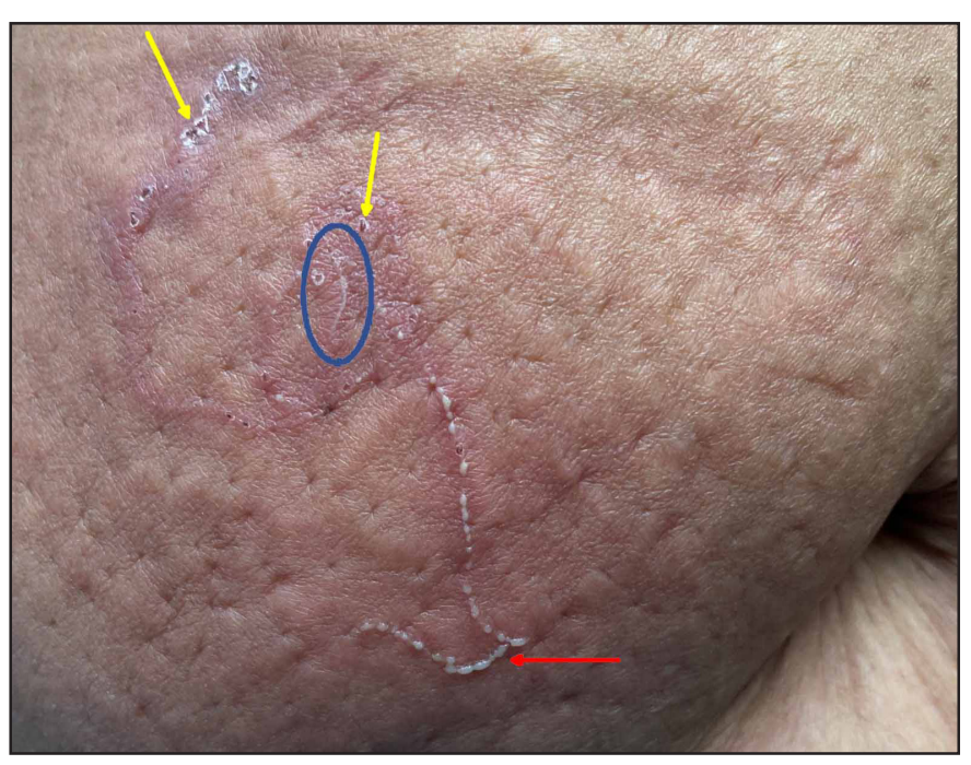
Figure 1: Well-defined elevated erythematous serpentine to bizarre tract of 2–3 mm width and 12 cm in length on an erythematous background with crusted erosions and scaling proximally (yellow arrows) and multiple pustules arranged in a linear fashion on distal end (red arrow) located on the right side of abdomen. Marked blue oval area shows larval body