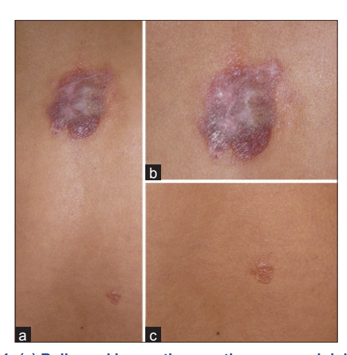
Figure 1: (a) Bullous skin eruptions on the upper and right lower back, (b) Large bullae on the upper trunk, flaccid, and yellowish-brown color surrounded by erythematous plaque, (c) Small clear bullae on the right of the lower back

Complete blood count, renal function, liver function and urinalysis were normal. Antinuclear antibody (ANA), extractable nuclear antigen (ENA) screen, qualitative urine porphyrin, serum protein electrophoresis and urine for Bence Jones protein were normal or negative. Roentgenogram and electrocardiogram were normal.