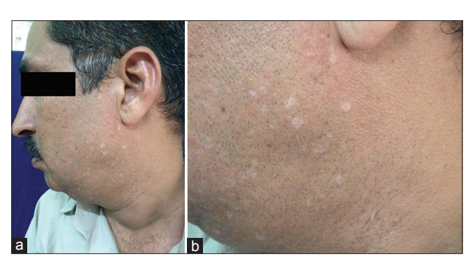
Figure 1: (a) Multiple, discrete, round to angulated, hypopigmented macules in the beard area. (b) Close up view of hypopigmented macules