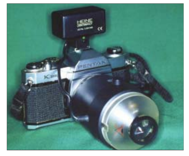
Figure 4: Dermaphot, a dermoscope with image capturing capability.

c) Dermoscope with image capture facility and analytical capability: These instruments are mainly used in western countries where the concern of melanomas is a driving force to improve