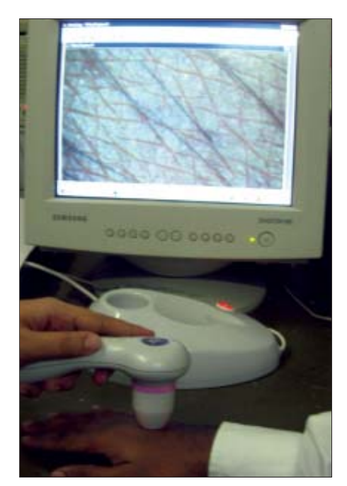
Figure 3: Dermoscope provides visualization of images on computer.

(Video dermascope<sup>®</sup>, Videocap 100<sup>®</sup>) has a high resolution camera fitted to the hand piece. The image is seen on the computer screen. Small videos can be taken with this instrument.