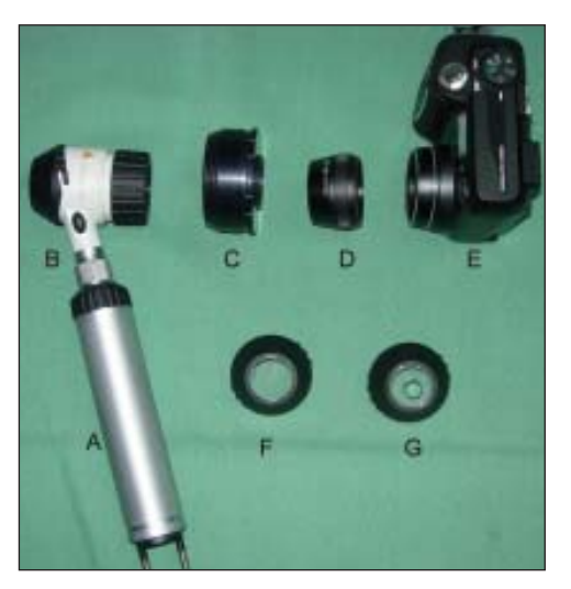
Figure 2: DELTA 20, a dermoscope with camera attachable facility. A, rechargeable handle; B, hand-piece; C, connector ring; D, photo-adaptor; E, camera; F, contact plate; G, small contact plate.