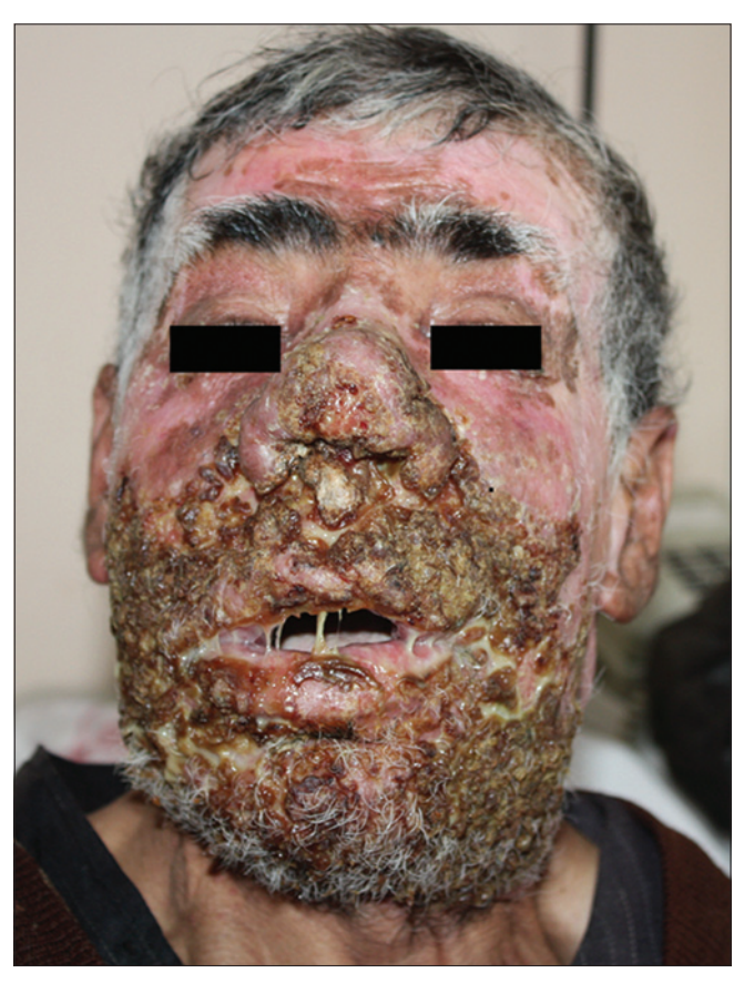
Figure 1: Massively crusted, granulomatous plaques on the central and lower face

became more visible. Histopathologic examination revealed acanthosis with pustule formation on the surface of follicular epithelium and a dense, diffuse inflammatory infiltrate of lymphocytes, many plasma