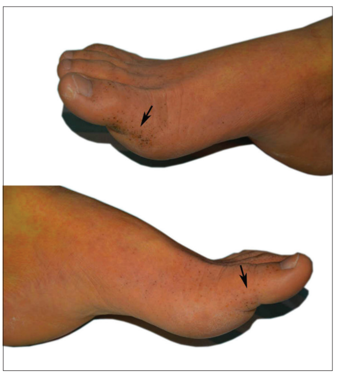
Figure 2: Multiple, green to black pin point macules on the soles

along the dermatoglyphic ridges. Patient denied any recent use of topical or oral medications. He also denied any contact with greenish dyes or substances. Histopathological examination of the lesional skin biopsy indicated hyperkeratosis, parakeratosis and deposition of a pink amorphous substance within the stratum corneum [Figures 3 and 4]. The gram stain, potassium hydroxide examination and hall stain (if positive indicates a yellow hue) were negative. Tissue cultures for bacteria and fungus were also negative. Liver function test indicated elevated levels of total serum bilirubin (20.1 mg/dl). Patient underwent an elective pylorus