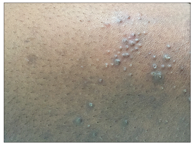
Figure 1: Spiky keratotic projections over the elbow of the mother

Multiple minute digitate hyperkeratosis is a term coined by Goldstein in 1967. It is an unusual disorder of keratinization of unknown etiology. This disorder is synonymous with digitate keratoses, disseminated spiked hyperkeratosis, minute aggregate keratoses, familial disseminated filiform hyperkeratosis, and spiny hyperkeratosis. The clinical