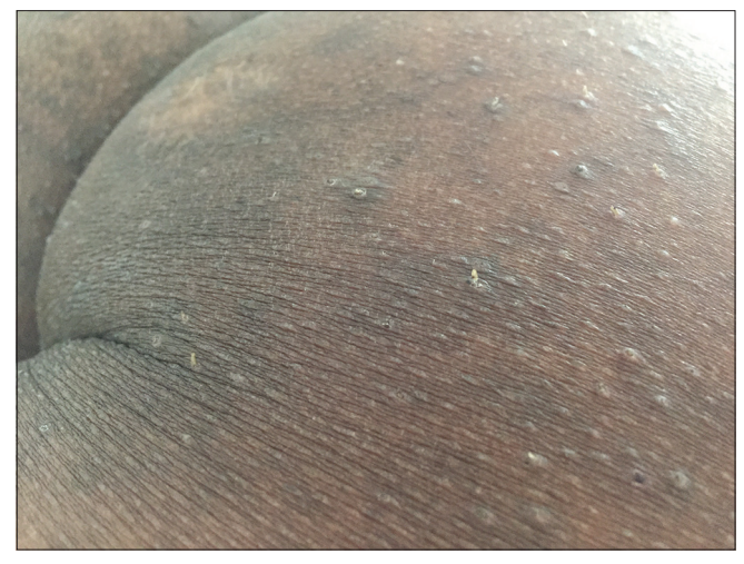
Figure 2: Spiky keratotic projections over the gluteal area of the mother