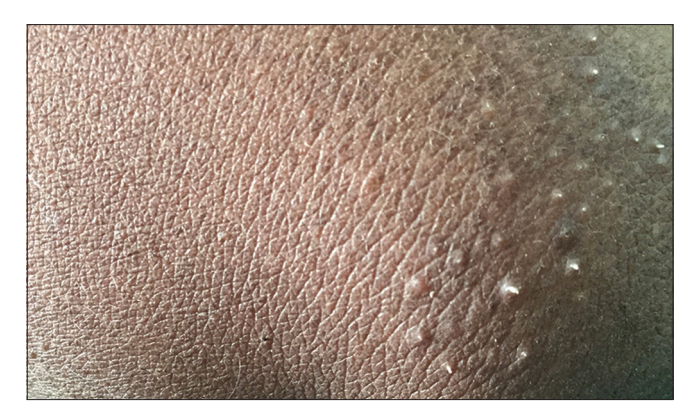
Figure 4: Spiky keratotic projections over the elbow of the child

Multiple minute digitate hyperkeratosis is a new chronic disturbance of keratinization, clinically and histologically