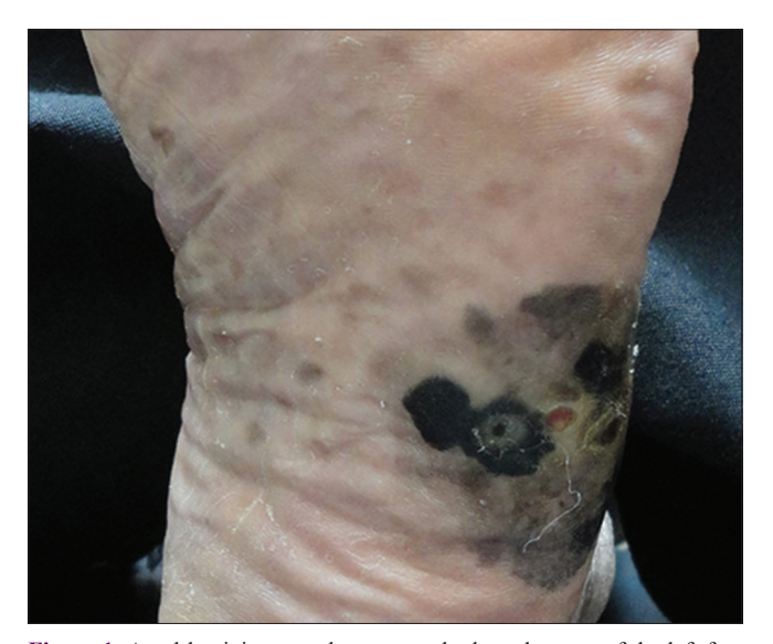
Figure 1: Acral lentiginous melanoma on the lateral aspect of the left foot showing irregularly bordered and variable pigmentation with a slightly centre ulcerated lesion

Previous studies have not found a linkage disequilibrium among these three susceptibility alleles which we found increased in acral lentiginous melanoma patients.<sup>17</sup> This implies that each allele confers risk separately and the risks are additive. Thus, patients who have more than one susceptibility allele been at a correspondingly greater risk of developing acral lentiginous melanoma, which does not happen when alleles are in linkage disequilibrium. Importantly, any of these alleles are not from native Amerindians.<sup>18</sup>