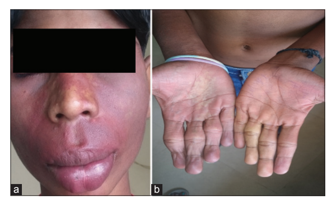
Figure 2: (a) Bluish grey pigmentation over left cheek (b) hypertrophy of fingers of right hand