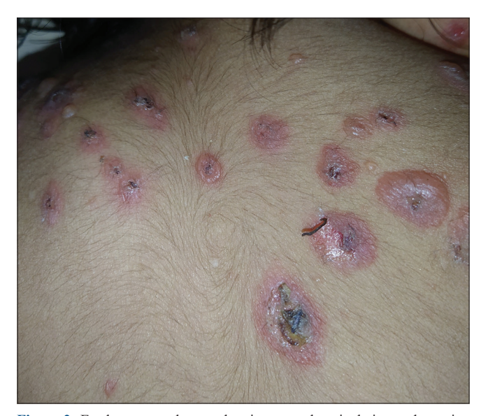
Figure 2: Erythematous plaques showing central vesiculation and crusting along with tense bullae on the back in linear IgA bullous dermatosis

Erythema multiforme-like erythema nodosum leprosum has been described in around 4.5% of leprosy patients. <sup>12</sup> Concomitant lesions of classic erythema nodosum leprosum may be seen in some cases. Palmoplantar lesions and mucosal involvement are not observed. Histologically, subepidermal edema, occasionally bulla, and few apoptotic keratinocytes are described. <sup>12,13</sup>