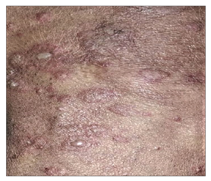
Figure 1: Raised typical and atypical target lesions in a patient of systemic lupus erythematosus