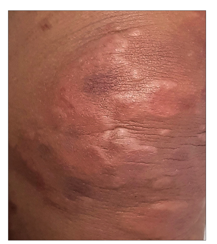
Figure 3a: Ill to well-defined targetoid plaques with central purpuric area surrounded by an edematous erythematous zone on the extensor aspect of the lower limb