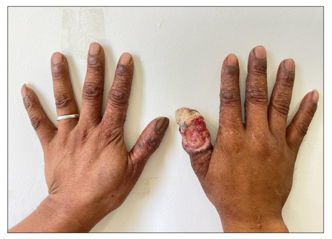
Figure 1: Ulcer involving dorsum of right thumb with indurated rolled out borders.

A 45-year-old male, X-ray technician by occupation, presented with a non-healing ulcer on his right thumb of 5 years' duration. He was treated elsewhere with multiple courses of antibiotics and antiseptic wound dressing without appreciable improvement. On enquiring, he revealed dipping of his right hand into the X-ray developer solution several times daily for 20 years. He also exposed his right hand frequently to the X-ray beam to hold the film while performing dental radiography. He has been performing about ten dental radiographic imaging daily for the past 20 years. He has no past or family history of cutaneous malignancies.