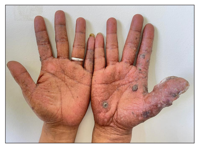
Figure 2: Poikiloderma and hyperkeratotic lesions involving the palms (more on the right hand side).

of the International Commission on Radiological Protection (ICRP), cumulative X-ray exposure should be less than 50 mSv per year and less than 100 mSv in 5 consecutive years.<sup>2</sup> The X-ray exposure in the present case during each exposure was 0.2 mSv. Thus, the cumulative exposure amounted to 600 mSv per year and 3000 mSv in five consecutive years which greatly exceeds the recommended safety limit.