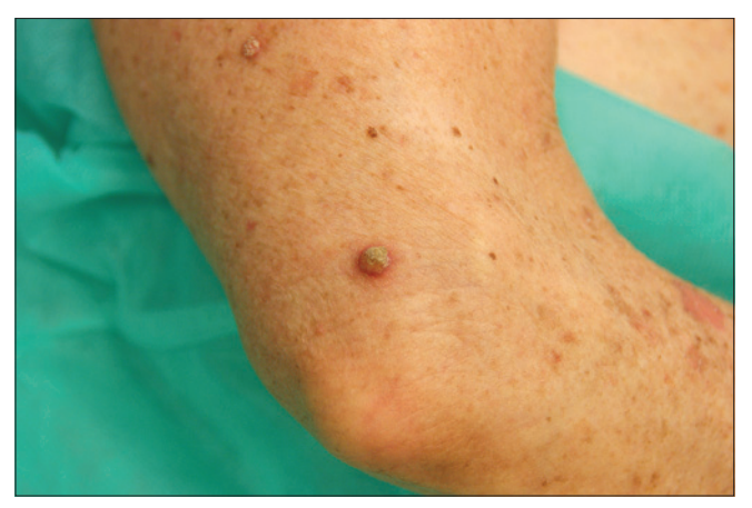
Figure 1c: Erythematous and hyperkeratotic papule on the arm