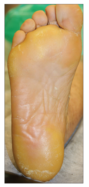
Figure 1d: Plantar hyperkeratosis

LGX818 (encorafenib) is a highly potent BRAF inhibitor under development for BRAF-mutated advanced melanoma. Initial results of a phase Ib study were reported in the 2013 ASCO annual meeting.<sup>3</sup> Its toxicity profile appears to be similar to those of vemurafenib and dabrafenib, with nausea, vomiting and headache being the most common adverse events. There were no cutaneous side effects in this report. After that, Anforth et al. <sup>4</sup> reported a case of bilateral plantar hyperkeratosis, verrucal keratosis, Grover's disease on chest and abdomen and eruptive nevi on the back, chest and legs in a 61-year-old man with metastatic melanoma, after 2 months of taking this