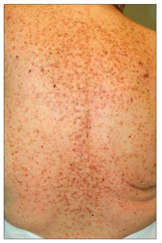
Figure 1b: Multiple erythematous and hyperkeratotic papules localized to the trunk and neck

Plantar hyperkeratosis presents with lesions predominantly at points of friction and blisters are infrequent. Hands are rarely involved. Nevertheless, we saw these types of lesions in our patient.