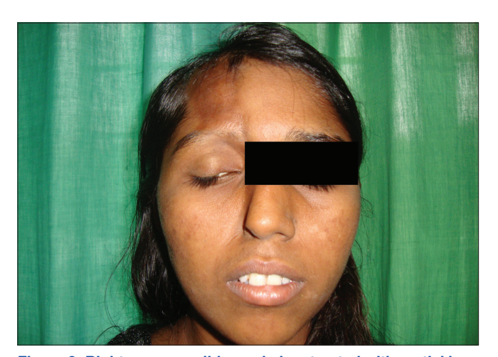
Figure 2: Right eye upper lid margin is retracted with partial loss of cilia

over the involved areas was smooth in texture, non-dyspigmented, and could be easily pinched up on palpation. In addition to this, right eye showed retraction of upper-lid margin with loss of cilia and same-sided ear pinna showed atrophy of the skin and cartilage [Figure 2]. She had a history of being operated for a congenital heart disease, i.e., Shone's complex (subaortic stenosis and coarctation of aorta and additional finding of patent ductus arteriosus, as evidenced by the transthoracic echocardiographic report of 2006) diagnosed almost 6 years back [Figure 3a and b]. Chest examination revealed sternotomy scar and cardiovascular system examination was normal. Dental examination was normal.