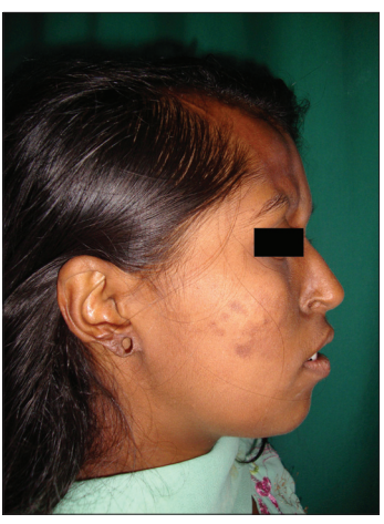
Figure 1: Right-sided facial atrophy and alopecia involving frontal area of scalp and eyebrow. This image also shows atrophied ear pinna

A 19-year-old female presented to our outpatient department with an asymptomatic, right-sided facial atrophy and alopecia involving frontal region of scalp and right eyebrow since four years [Figure 1]. Skin