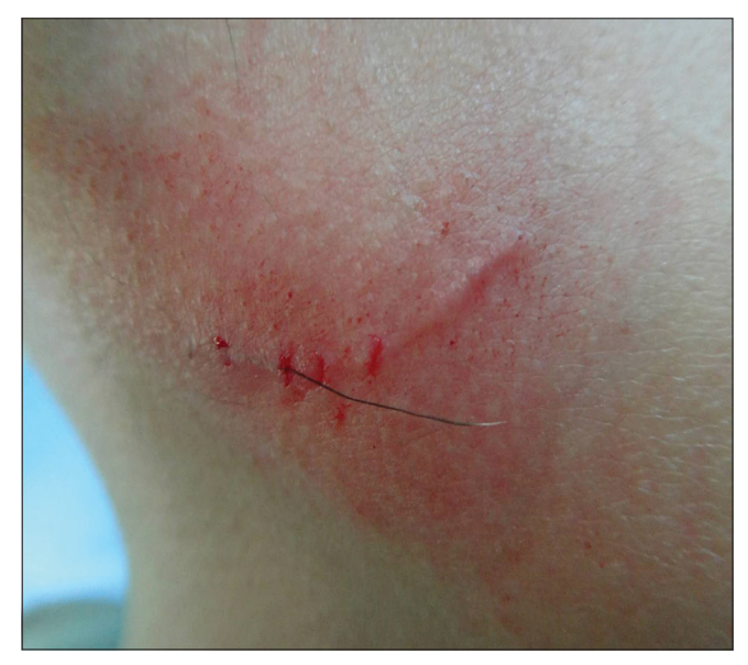
Figure 4: The black thread is the hair shaft

burrowing hair, moving hair, creeping hair and ingrowing hair.<sup>4</sup> Some scholars hold the view that "ingrowing hair"