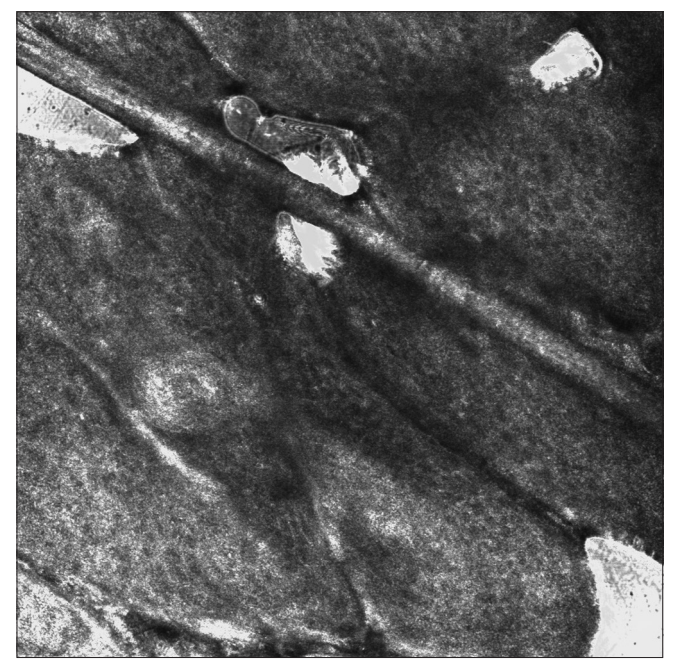
Figure 2: The image shows the low-refractive hair in the skin

NF: not found (due to unavailability of similar Japanese journals)