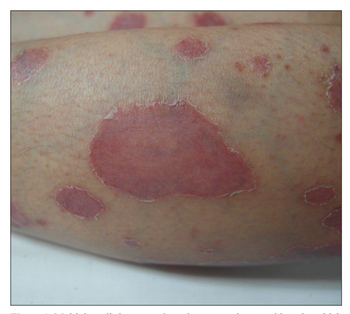
Figure 1: Multiple well-demarcated, erythematous plaques with scales which are predominantly at the edges. First presentation of psoriasis at 37 years old.

The use of ustekinumab in SLE is promising. It would be a very useful treatment option in patients with coexisting SLE and psoriasis; however, contrary to the favorable reports on the efficacy of ustekinumab in CLE and SLE, we observed severe flares in our patient during ustekinumab therapy. The characteristics of patients who will most likely respond to treatment need to be delineated further. A single drug that is able to treat both psoriasis and SLE is desirable to minimize adverse reactions and cost.