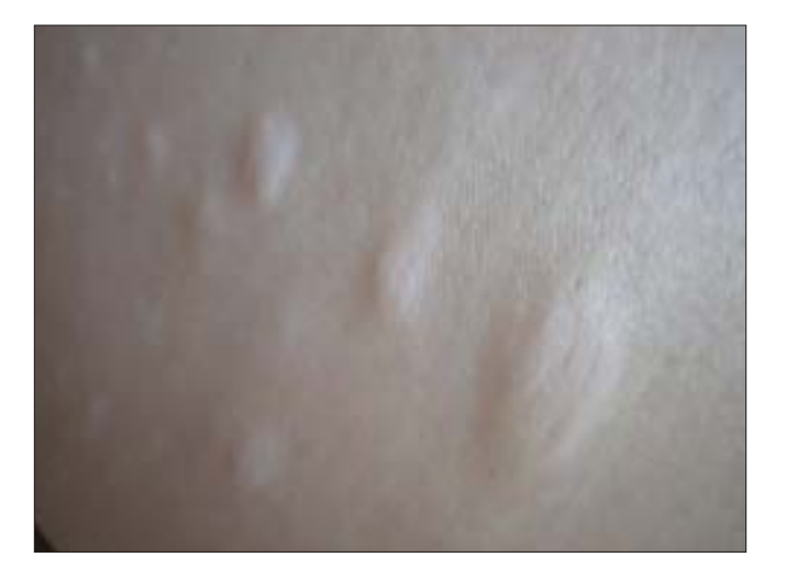
Figure 2: A closer view of the lesions

like projections. The skin surface appeared thinned and wrinkled. The rest of the physical examination, including ocular fundi, was normal. A diagnosis of anetoderma was postulated.