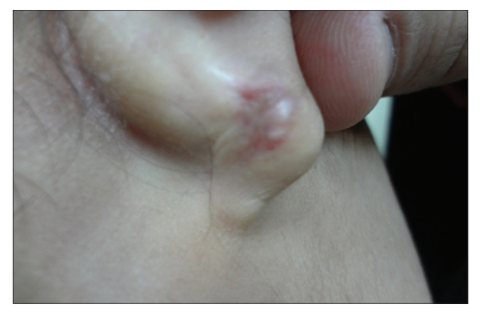
Figure 3: A 19-year-old woman 9 months postoperative