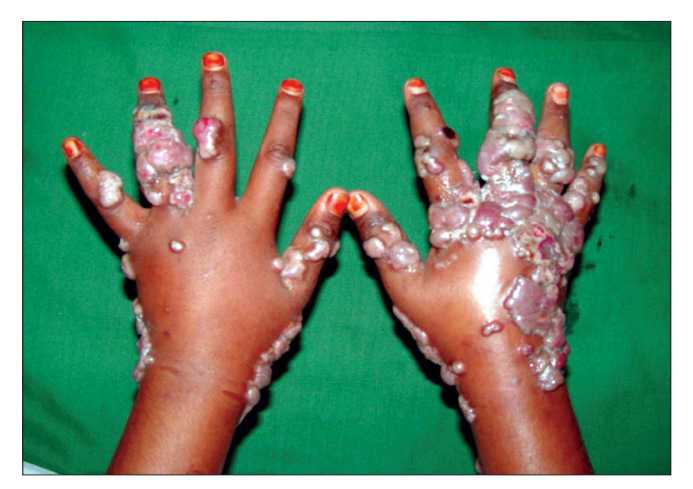
Figure 1: Multiple, flesh colored papules, pustules and nodules coalescing to form plaques