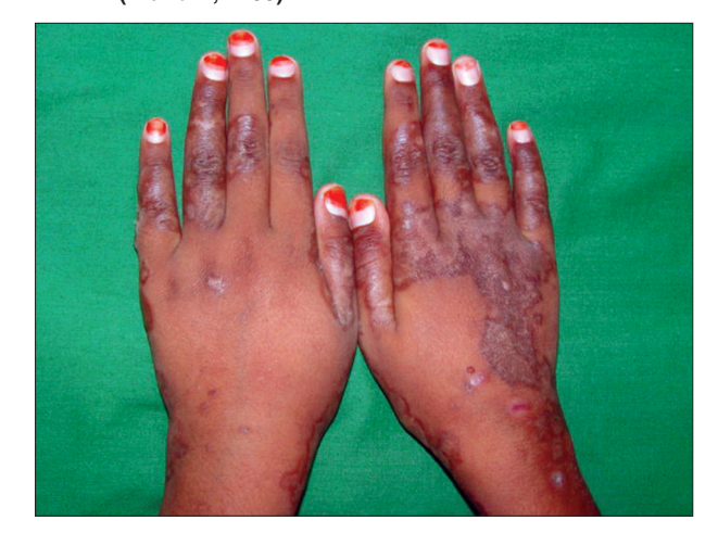
Figure 4: Post treatment clearance of lesions

cultures and negative cultures for AFB and fungi strongly suggested the diagnosis of blastomycosis-like pyoderma though our patient did not meet all criteria for diagnosis as bromide levels could not be done.