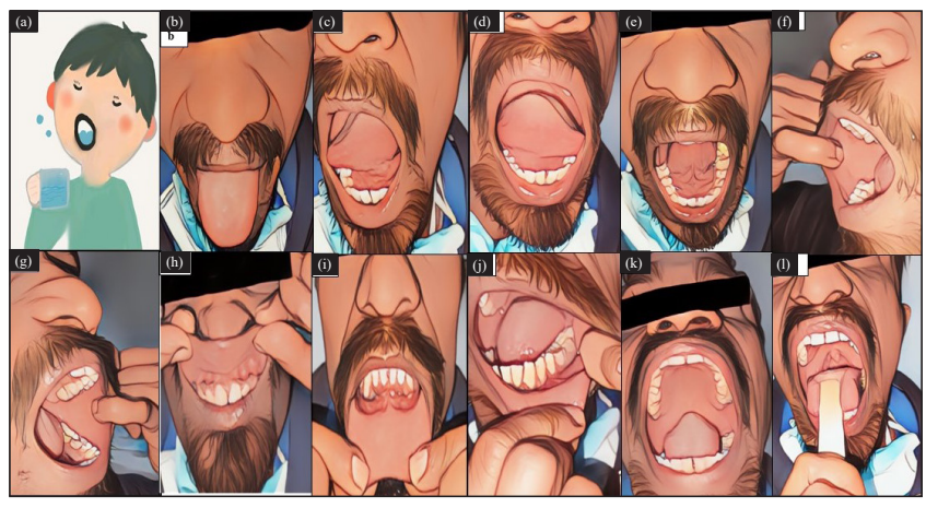
Figure 2 (a-l): Images used in oral cavity photography instruction videos demonstrating (2a) rinsing mouth, (2b) upper surface of tongue, (2c) left lateral border of tongue, (2d) right lateral border of tongue, (2e) ventral surface of tongue and floor of mouth, (2f) right buccal mucosa, (2g) left buccal mucosa, (2h) upper lip and upper gingival mucosa, (2i) lower lip and lower gingival mucosa, (2j) left lower lateral gingivo buccal sulcus, the same way can be followed for right lower lateral gingivo buccal sulcus, (2k) hard and soft palate, (2l) posterior wall of pharynx.