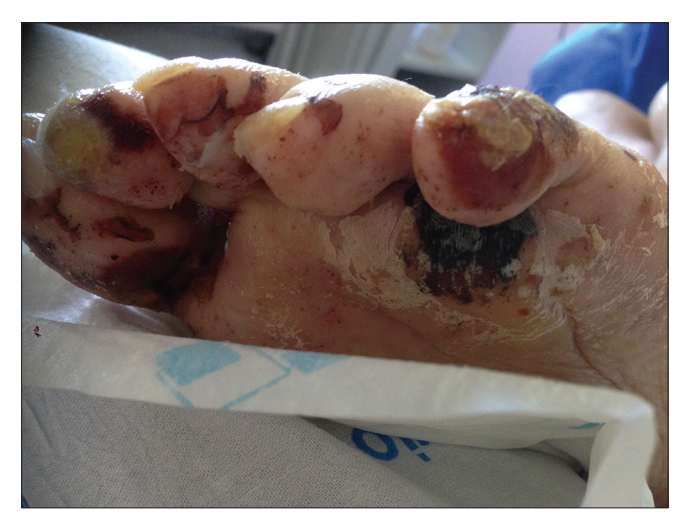
Figure 3c: Acral areas such as toes were also affected