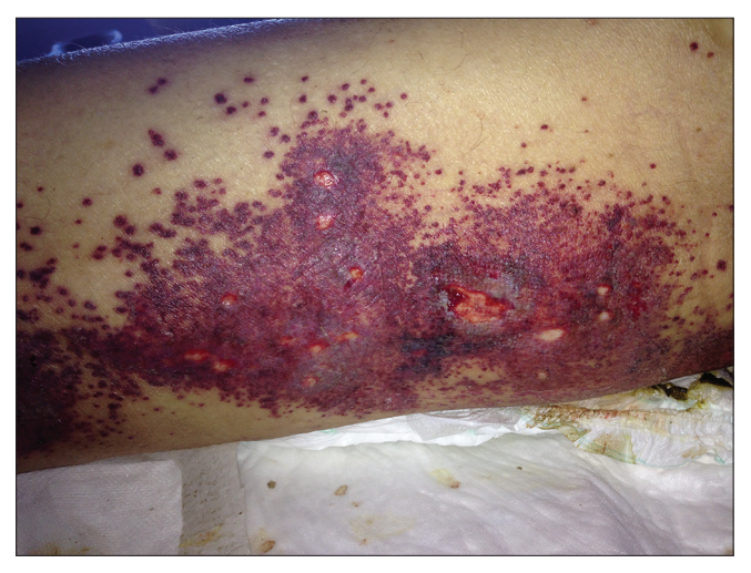
Figure 3a: Violaceous, confluent papules and necrosis areas in lower limbs were developed 48 hours after terlipressin was started

necrotic areas with sharp demarcation on the thighs, ankles and toes that further extended in the next 2 days [Figure 3]. Investigations including an echocardiogram, immunological analysis, antinuclear antibodies, antineutrophil cytoplasmic antibodies, IgG, A, M, complement studies and cryoglobulins were normal or negative. Levels of proteins C, S and platelet count were decreased, probably due to the underlying hepatic failure. Anticardiolipin and anti-beta2 glycoprotein IgA antibodies were normal. Blood cultures were sterile. A new skin biopsy showed detachment of the necrotic epidermis, intense spongiosis and red blood cell extravasation with perivascular infiltration of mononuclear cells in the deep dermis without signs of thrombotic vasculopathy or vasculitis. The diagnosis of skin necrosis induced by terlipressin was made and the medication was stopped. Unfortunately, although his skin lesions