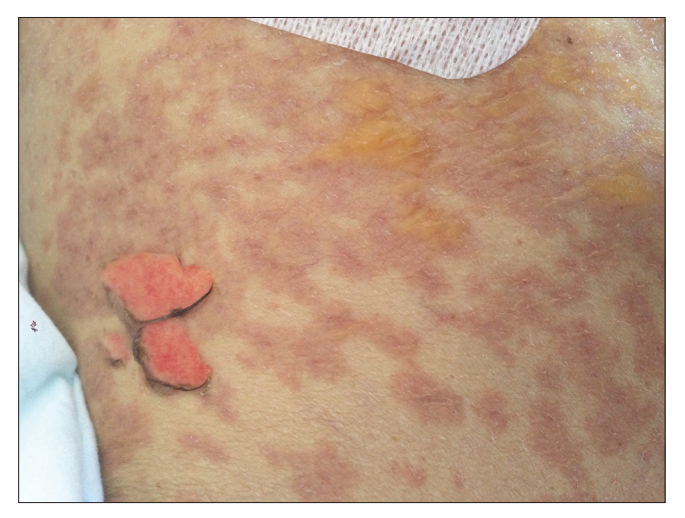
Figure 1a: The patient presented big denuded areas that resembled toxic epidermal necrolysis

A 54-year-old man with Child-Pugh C alcoholic cirrhosis was admitted with acute variceal bleeding. An upper gastrointestinal endoscopy with variceal