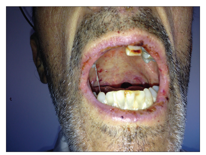
Figure 1c: The oral mucosa was completely affected with hemorrhagic crusts on lips and denuded and erosive areas

Two weeks following admission, the patient developed discrete and grouped tense bullae on his trunk, soles and feet. A large denuded area was observed on the buttocks and erosions were also seen in the oral mucosa [Figure 1]. The possibility of toxic epidermal necrolysis syndrome was considered and a skin biopsy was performed. We decided to continue terlipressin in view of the underlying hepato-renal involvement and systemic corticosteroids were started for the cutaneous eruption. Meanwhile, the skin biopsy showed subepidermal cleavage with neutrophilic inflammatory infiltrate and direct immunofluorescence revealed intense linear deposition of IgA at the basement membrane zone [Figure 2]. Thus, a diagnosis of linear IgA bullous dermatosis due to vancomycin was made. As vancomycin had been previously stopped, we did