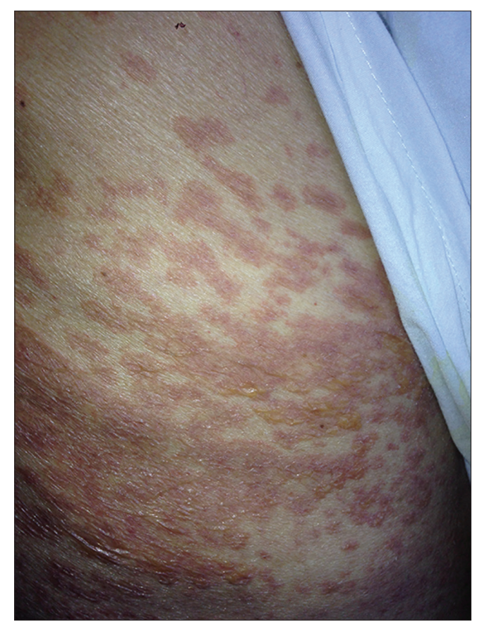
Figure 1d: Some serous, confluent bullae were observed in trunk

One week later, the patient developed generalized discomfort accompanied by oval, violaceous and confluent papules on the lower limbs and large