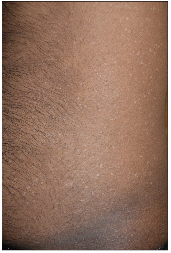
Figure 1b: Numerous hypopigmented macules and papules on the trunk