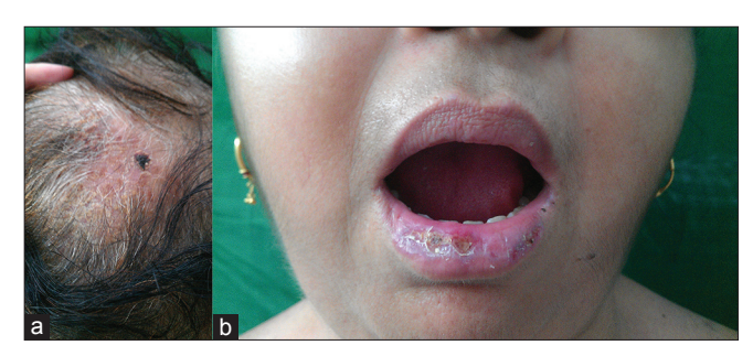
Figure 2: (a) Bright pink erythematous rash with overlying scaling on the scalp. (b) Violaceous reticulate plaque with polycyclic margins and superficial erosions on the lower labial mucosa