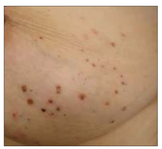
Figure 3: Residual post inflammatory hyperpigmentation and excoriations on some lesions after cryotherapy

Karadag and Şimşek Angiokeratomas on breast