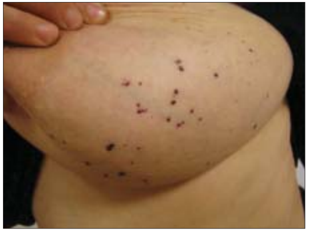
Figure 1: Multiple 1–4 mm, red–blue, warty and non warty papules on the left breast

ACN is an unusual type of localized angiokeratoma that occurs most frequently in childhood and is usually characterized by large, linear and hyperkeratotic plaques. ACN is sometimes associated with an underlying vascular malformation and/or with atrophy or hypertrophy of the regional soft tissue and bone. [1,3] Nevoid malformations or malformations of the underlying deeper vasculature might be a cause of ACN. Post traumatic arteriovenous fistula might be another cause of this type of angiokeratoma. Classic neviforme may not be seen in every case. The differentiation of ACN from verrucous hemangioma is sometimes challenging. [3]