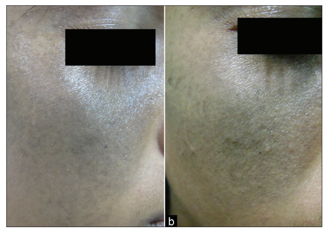
Figure 2: (a, b): Pre- and post-Qsw Nd:YAG laser sitting with <25% improvement after 10 sittings