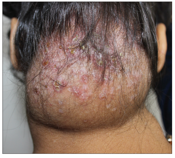
Figure 1: Soft swelling on nape of neck studded with erythematous papules, many of them covered with yellowish crust

Rosai–Dorfmann disease, tuberculosis and histoplasmosis. The lesion on trunk was subjected to histopathology. Fine-needle aspiration cytology was done from swelling on the neck. Dense infiltrate in papillary dermis comprising of Langerhans cells having eosinophilic cytoplasm with coffee bean nuclei having vesicular chromatin and prominent nucleoli was found on histopathology which were positive for CD1a on immunohistochemistry [Figures 4-6]. Fine-needle aspiration cytology also showed similar picture of Langerhans cells [Figure 7].