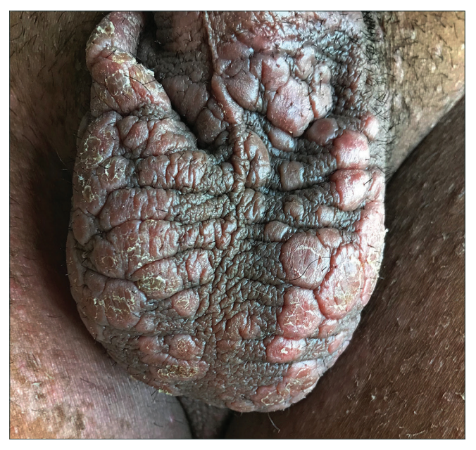
Figure 1a: Multiple erythematous, flat-topped, round to oval plaques over the scrotum

and systemic examination revealed no significant abnormalities. Cutaneous examination showed multiple, erythematous, flat-topped, round to oval, firm, non-tender plaques distributed over the scrotum [Figure 1a]. A few pigmented macules were seen over the soles [Figure 1b]. Mucosal examination revealed no abnormal findings. A skin