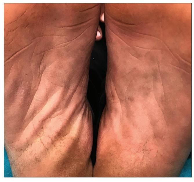
Figure 1b: A few pigmented macules over instep of soles

How to cite this article: Bains A, Tyagi N. Scrotal plaques as a predominant presentation in a case of secondary syphilis. Indian J Dermatol Venereol Leprol 2021;87:252-4.