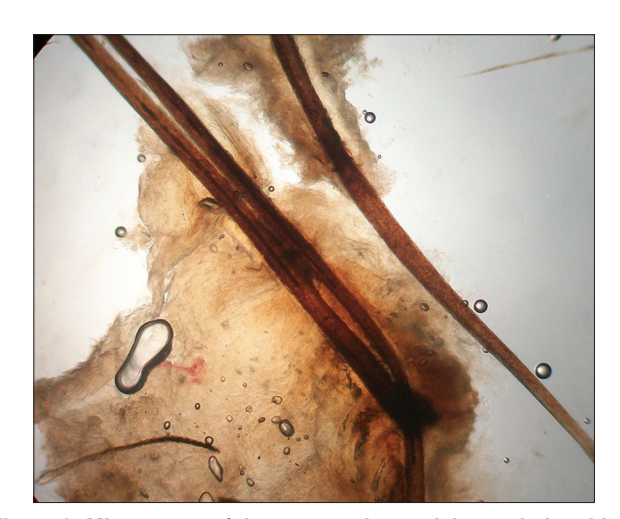
Figure 3: Microscopy of the extracted material revealed multiple hairs with keratinous material

How to cite this article: Vaishnani JB. Secondary comedones after waxing. Indian J Dermatol Venereol Leprol 2015;81:96. Received: December, 2013. Accepted: February, 2014. Source of Support: Nil. Conflict of Interest: None declared.