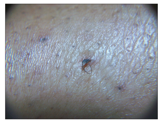
Figure 2: On manual extraction, black greasy material along with hair came out from the lesion