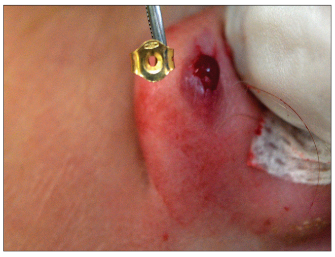
Figure 3: The removed back of a gold butterfly earring, that was completely embedded in the left ear lobe