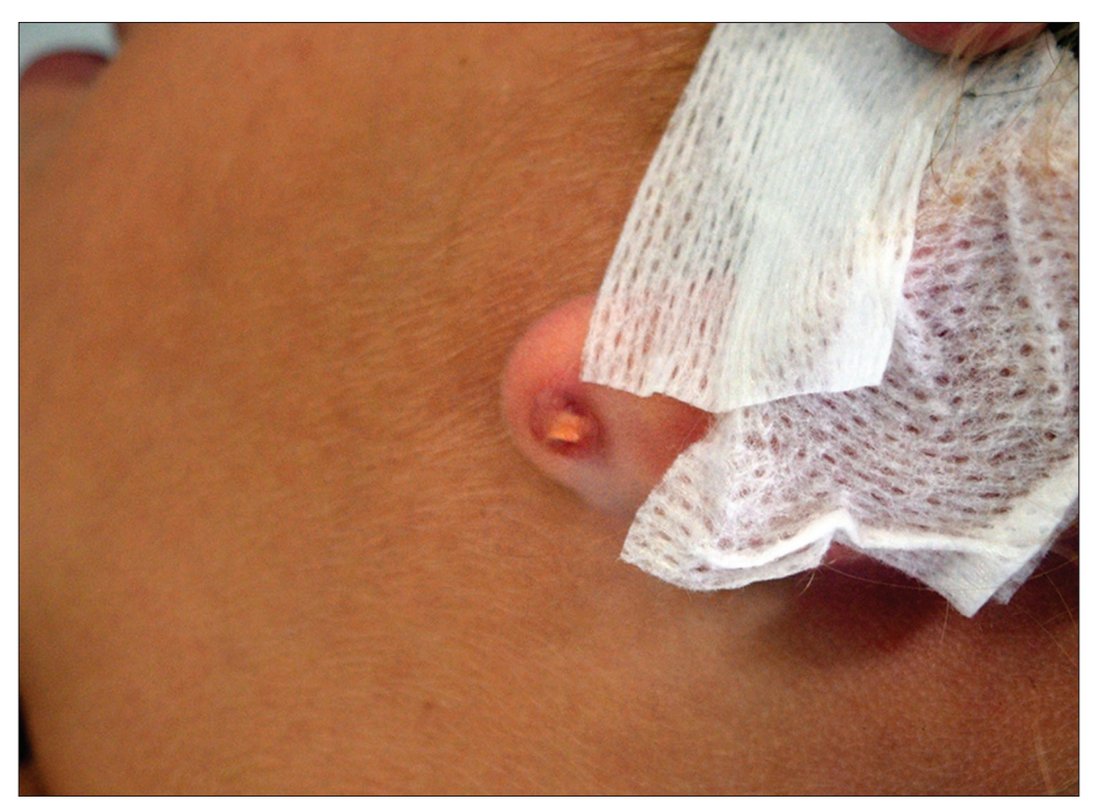
Figure 1: Clinical view of the nodule of left ear lobe

A six-year-old girl presented with a 10 months' history of a nodule on the left ear lobe. Examination revealed that there was a single very firm nodule of about 0.5 cm diameter behind the ear lobe. It was characterized by peripheral erythema and arborizing telangiectatic vessels [Figure 1]. Dermatoscopic evaluation revealed the presence of arborizing, branching and non-branching vessels radiating toward the center of a gold shiny background area; the vessels did not cross the center of the nodule [Figure 2]. The lesion was asymptomatic. The mother reported a previous occurrence of what seemed to be an infection following ear piercing with the spring-loaded gun technique. She also reported never having found the back of the earring again. After administration of a local anesthetic, the nodule was opened surgically. The back of a gold butterfly earring, completely embedded in the left ear lobe, was removed [Figure 3].