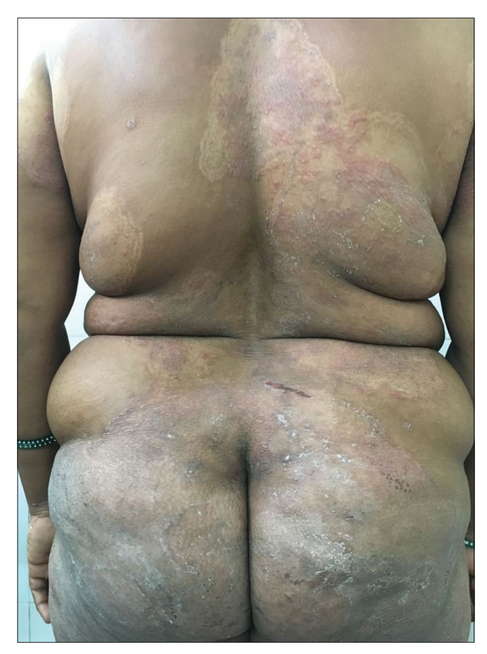
Figure 1b: Recurrent dermatophytosis

practitioners, on advice of pharmacist at chemist shops or recommended by friends and family members. There is a tendency to reuse old prescription for recurrent or new lesion. Prescription sharing with relatives and friends on the presumption that similar-looking skin problems can be self-treated by simple prescription copying is also common.