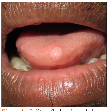
Figure 1: Solitary flesh-coloured, domeshaped, smooth papule on the tip of the tongue