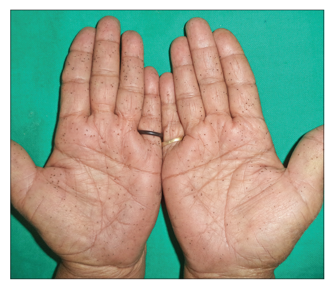
Figure 1a: Multiple, small 1-2 mm, discrete keratotic papules present over palmar surfaces of both hands