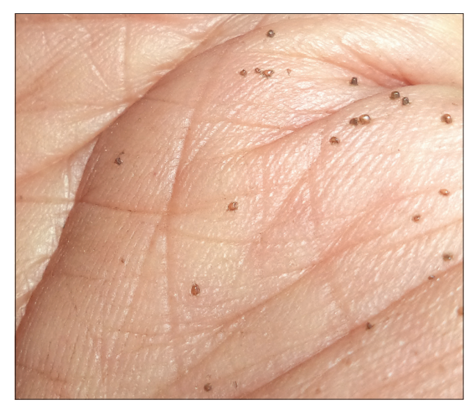
Figure 1b: Closer view of the lesions showing brownish colored spiky projections present over palmar surface of hand

A 60-year-old healthy female presented with gradually increasing, spiky projections on both palms for 5 years. On examination, multiple, discrete, firmly adherent, keratotic papules of the size 1–2 mm were noted over both the palms [Figure 1a and b]. Rest of the cutaneous and systemic examination was unremarkable. Wet contact dermoscopy showed normal skin markings with brownish, keratotic, ovoid projections [Figure 1c]. Complete hemogram, lipid profile, chest roentgenogram, and abdominal ultrasound were normal. Histopathology of the 3 mm punch skin biopsy showed a sharply defined column of parakeratotic cells with underlying hypogranulosis; other layers of the skin were unremarkable. A diagnosis of spiny keratoderma or "music box spine keratoderma" was made. She was treated with urea and salicylic acid formulation which led to slight improvement. Patient is under follow up to look for development of any systemic diseases or malignancy.