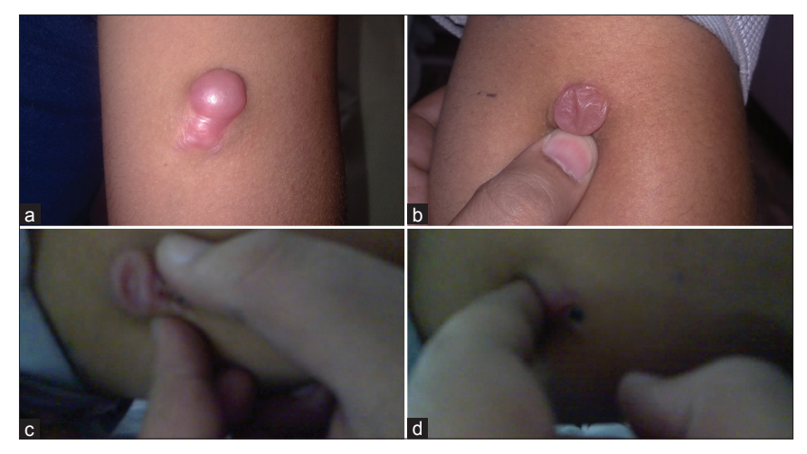
Figure 1: Clinical findings. (a) Tense, erythematous bullae overlying a nodular mass on the left arm. (b) Blister collapsing into a loose sac on pressing the smaller blister. (c) Lesion dimpling on lateral pressure. (d) Lesion allowing buttonholing on vertical pressure

Bhushan and Hussain Bullous pilomatricoma