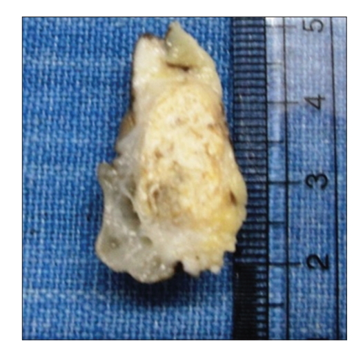
Figure 3: Gross specimen of excised material showing multilocular bullae nearing epidermis and a solid tumor present in the deep dermis with a chalky white cut surface and lobulated appearance