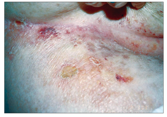
Figure 2: Closer view of the tense, shiny skin underlying the vesicles and bullae

Lichen sclerosus et atrophicus (LSA), in which the clinical features are confused with morphea,<sup>[6]</sup> also forms bullae in the patches.<sup>[9]</sup> The presence of bullae in LSA is more frequent than in morphea and has a hemorrhagic component.<sup>[10]</sup> In the literature, there are conflicting reports about the nature and very existence of bullous morphea. Some authors have suggested that there is a close relationship between LSA and morphea,<sup>[11,12]</sup> while others considered it as different manifestations of a single disease spectrum.<sup>[13,14]</sup> However, Patterson and Ackerman<sup>[15]</sup> emphasized that the two conditions were entirely separate.