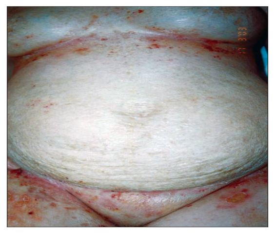
Figure 1: Eroded and crusted bullae overlying the morpheic plaques on the inframammarian and inguinal skin