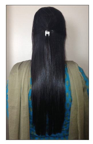
Figure 9: Hair straightened with lanthionization

Hair straightening can be very damaging to the hair and even when performed correctly, can result in loss of up to 20% of the tensile strength of virgin hair. It results in physical damage to the hair with loss of proteins and moisture resulting in dry, brittle hair. Many patients experience hair fall and breakage and may present to the clinic with alopecia.<sup>[51,52]</sup> Hence,