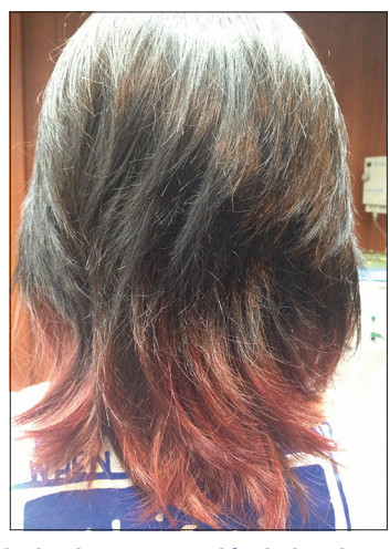
Figure 7: Dip - dyeing is a new trend for hair color among the youth