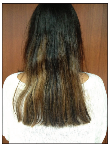
Figure 8: Ombre is another popular hair dyeing style

shaded color [Figure 8]. Chan and Maibach reviewed reports of eight cases with adverse reactions (chemical burns) caused by hair highlighting. The event was due to caustic chemical, thermal burn, or toxic reaction to the dye.<sup>[44]</sup>