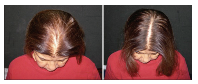
Figure 3: (a and b) Cosmetic camouflage with a cover-stick: Before and immediately after application

These include hair cosmetics that work on the cortex or alter the structural integrity of the hair shaft and include hair colors, bleaching agents, straightening, and perming agents.