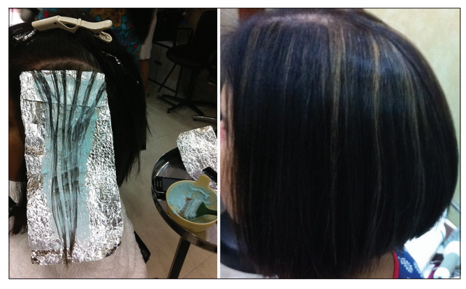
Figure 6: (a) Silver foil used to isolate strands of hair for highlighting / bleaching (b) End result of the 'highlighting' process

spray, which contains semi-permanent or permanent color. Various coloring styles are used to enhance the overall aesthetic appeal. Dip dyeing [Figure 7] is a process where only the hair ends are colored with a dye different from the base hair color. Ombré (French: Shaded) is a new trend where hair is dyed to give a