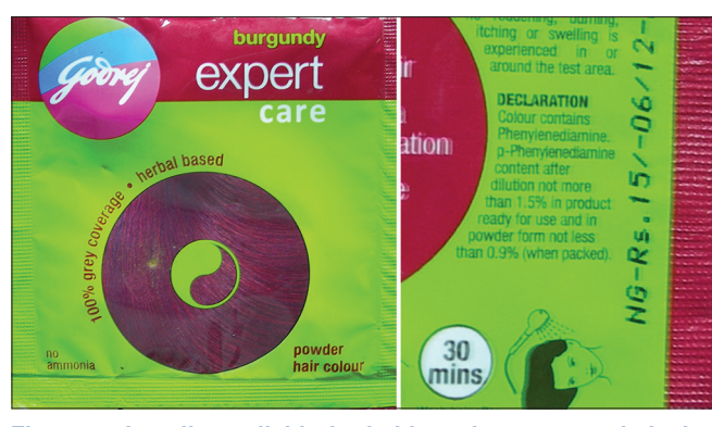
Figure 5: Locally available herbal-based permanent hair dye containing para-phenylenediamine. (a) (Inset) [close up image showing the para-phenylenediamine content declaration]

is 2-hydroxy 1,4 napthaquinone. The active ingredient is obtained by treating the leaves with sodium bicarbonate. It is available as a powder that is mixed with coffee powder, and made into a paste with black tea water, allowed to stand for a couple of hours, and then applied to the hair. The contact time is a couple of hours, after which the hair is washed and shampooed. This process is useful for people allergic to para dyes. It is a messy process, and the henna leaves a strong odor in the hair that lasts several days. The end result is dry hair with an orange-red tint. The color fades gradually with shampooing and has to be reapplied as and when required. Although relatively inert, bullous allergic contact dermatitis (ACD) has been reported in a three-year-old child.<sup>[38]</sup> A locally available black hair dye by Godrej is marketed as completely natural and contains reetha (soapnut), shikakai (Acacia concinna), bhringraj (Eclipta prostrata), mehendi (henna) and aamla (Indian gooseberry). Shikakai and reetha act as natural cleansing agents, mehendi as a natural colorant/conditioner, and aamla as a natural hair darkener. Over the last few years, 'black henna' is being used for decorative, 'instant' tattoos at events and tourist attraction spots. These contain, in addition to the henna, a para dye, and thus, can cause allergic reactions. Several such cases have been reported.<sup>[39]</sup>