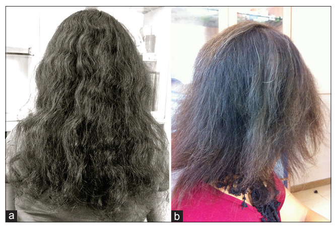
Figure 1: (a and b) Naturally weathered hair, Weathered following cosmetic procedures

The hair surface in untreated hair has a pH of 4.5 to 5.5. This acidic pH helps to keep the cuticular cells closely opposed to the cortex. Damage to the cuticle results in structural changes to the hair shaft over a period of time and constitutes hair weathering. As the scalp hair of women grows over long anagen periods, the hair is exposed to several years of cumulative damage from external factors [Figure 1a]. The contributing factors include chronic ultraviolet exposure, excessive wetting, repeated harsh chemical procedures [Figure 1b], hot combs, blow-drying, and even simple, but repeated activities, such as rough combing and brushing.<sup>[5,6]</sup> Loss of cuticle or lifting-up of the cuticular plates