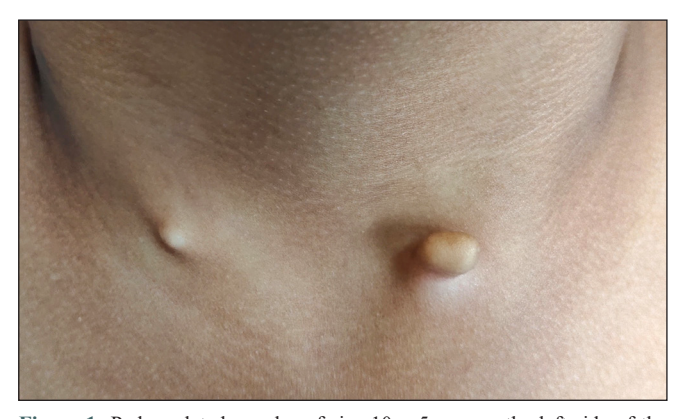
Figure 1: Pedunculated papules of size 10 \times 5 mm on the left side of the neck and measuring 4 \times 4 mm on the right side of the neck.

The accessory tragus is a subcutaneous, firm papule or nodule that develops due to dysplasia or failure in the fusion of auricular hillocks of the first (mandibular) and second (hyoid) branchial arches. It is estimated that accessory tragus can occur as frequently as in 1 to 2 births per 1000. By the fifth and sixth weeks, these arches produce six mesenchymal tubercles, referred to as "hillocks of His." Each arch forms three hillocks that gradually merge and transform into the recognizable structures of the auricle, which gradually ascends from the neck to the side of the head. The accessory tragus is found near the tragus or along an imaginary line