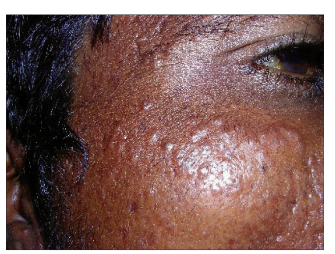
Figure 1: Multiple, skin colored papules over face