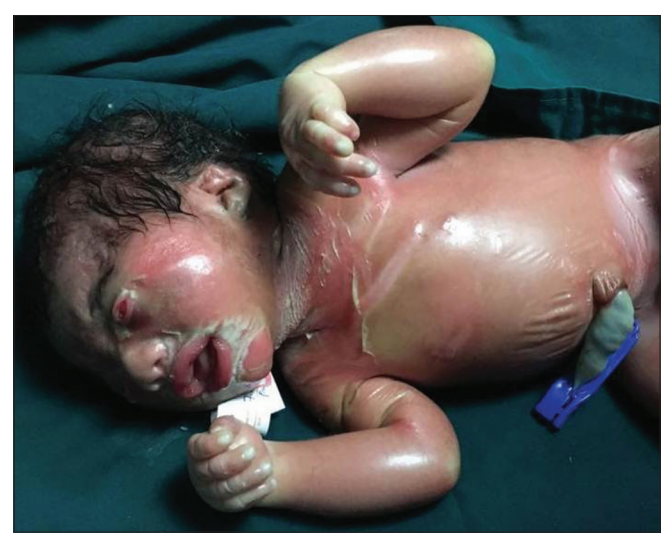
Figure 1: Child at birth with collodion membrane

We report a two-year-old boy, born to second-degree consanguineous, South Indian parents, Dravidian by origin, following an uneventful pregnancy. At birth, the child had collodion membrane associated with ectropion and eclabium [Figure 1]. The collodion membrane subsequently shed by four weeks, exposing a mildly xerotic skin. However, at the age of one year four months, the child developed fine generalized scaling with well- defined erythematous and scaly areas involving the the angles of mouth, neck, axillae, scalp and groin along with mild palmoplantar keratoderma, with mild ichthyosiform erythroderma consistent [Figures 2a-2d]. Systemic examination was unremarkable. Family history revealed similar dryness of skin in the child's father at birth which gradually improved with age, without