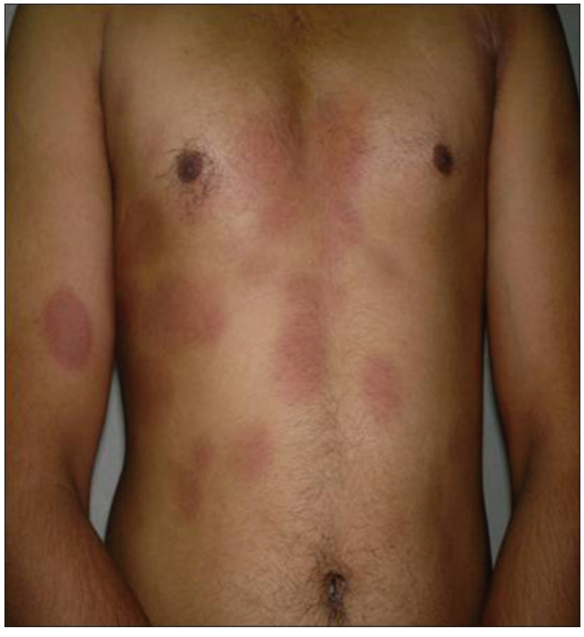
Figure 1a: Multiple well defined erythematous macules over chest