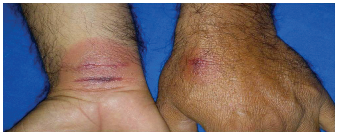
Figure 3a: Active lesions of FDE on wrists