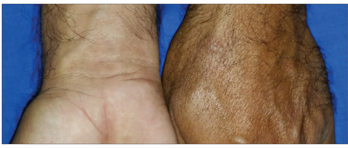
Figure 3b: Healed lesions without any significant pigmentary residue

popularized by Shelley and Shelley in 1987. They postulated that the likely site of the drug-induced hypersensitivity response was the dermis rather than the epidermis, in such cases. Hence, there was no pigment incontinence, and therefore, no pigmentary sequelae after the initial lesion subsided.<sup>[6]</sup>