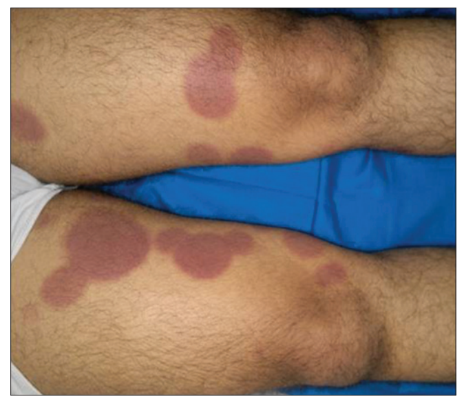
Figure 1e: Multiple well defined erythematous macules over lower limbs