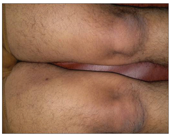
Figure 1f: Lesions over lower limbs post resolution

(500 mg) from a chemist for a furuncle on the right leg. This time too, the lesions healed without any residual pigmentation in about 2 weeks. A month later, after obtaining informed consent, the patient was challenged with incremental doses of tinidazole without any reaction. Provocation with half the therapeutic dose of norfloxacin (200 mg) resulted