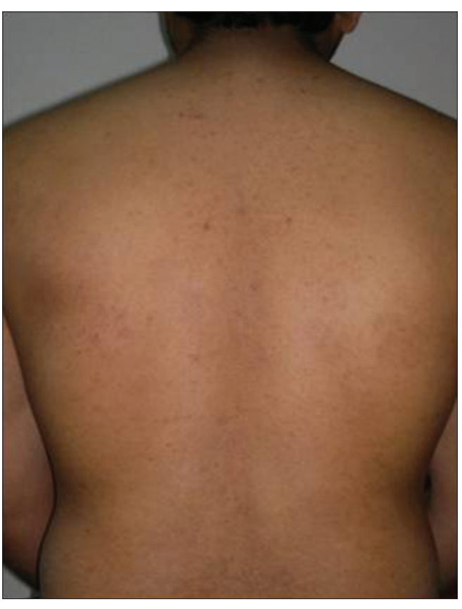
Figure 1d: Lesions over back after resolution

later, the patient reported back with similar lesions that developed 2 hours after taking ciprofloxacin