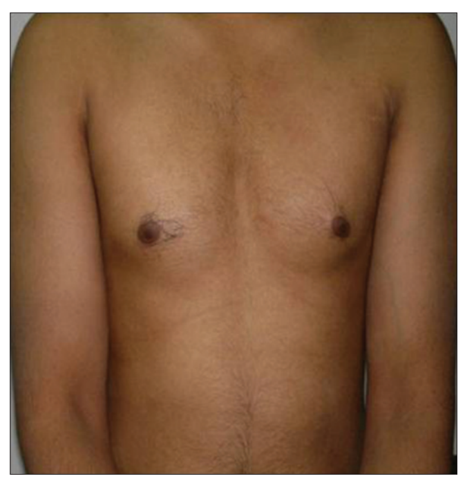
Figure 1b: Chest lesions after resolution; note the absence of any residual pigmentation