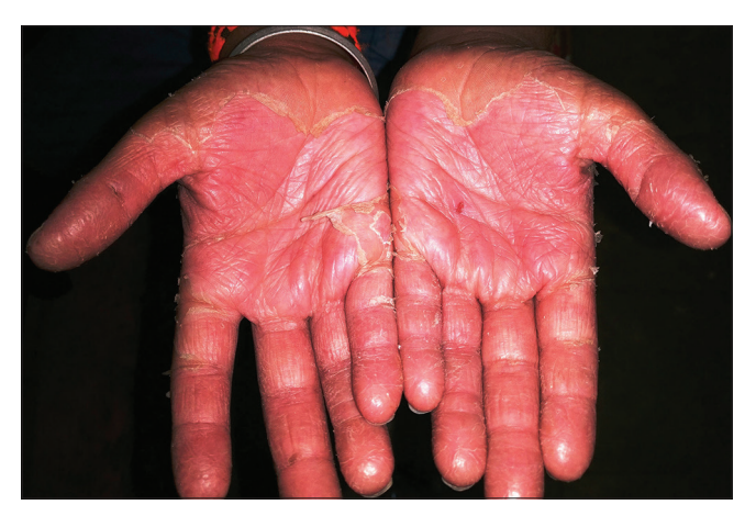
Figure 6: Desquamation of hands in Kawasaki disease

limbal region, dry fissured lips, hyperemia of the pharynx, strawberry tongue [Figure 4], unilateral (usually single) nonsuppurative cervical lymphadenopathy, edema of the hands and feet and an exanthem which may be macular, maculopapular, scarlatiniform, or erythema multiforme-like. Perianal erythema and desquamation [Figure 5] is also seen in the acute phase. Cardiac involvement in the form of myocarditis and pericarditis with effusion can also occur in the acute phase. The second (subacute) phase lasts for approximately 3 weeks and is characterized by periungual desquamation which may extend to involve the entire hands [Figure 6] and feet, thrombocytosis and coronary artery aneurysm (developing in 25% of untreated cases). The third (convalescence) phase is characterized by remission of all the clinical signs with persistently elevated erythrocyte sedimentation rate which takes approximately 6-8 weeks to normalize.25 Diagnosis of Kawasaki disease is based on the criteria laid down by the American Heart Association as there is no specific investigation for the diagnosis.26 Treatment involves administration of high-dose aspirin with intravenous immunoglobulin (2 g/kg single infusion over 10 hours).5