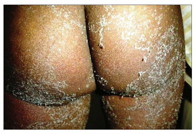
Figure 5: Perianal desquamation in Kawasaki disease

Kawasaki disease is an acute febrile multisystem idiopathic systemic vasculitis of childhood, commonly affecting the age group between 3 months and 8 years. The exact etiology of the disease is unknown although a viral infectious and a bacterial superantigenic roles have been implicated based on certain characteristics of the disease such as focal outbreaks, seasonal peaks in winter and spring and clinical features of exanthem, enanthem, conjunctival congestion and lymphadenopathy. Profound immunological activation involving both T and B lymphocytes and elevated proinflammatory cytokines mediate the disorder.<sup>3,23,24</sup> The clinical course of Kawasaki disease can be divided into three successive phases. The initial acute febrile phase (lasting for up to 2 weeks) is characterized by prolonged unremitting fever unresponsive to antibiotics, bilateral bulbar conjunctival injection that is typically nonexudative and sparing the