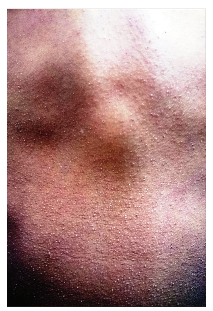
Figure 3: 'Sand paper' rash in scarlet fever

with anterior cervical lymphadenitis and petechial lesions on the soft palate, posterior pharynx and uvula.<sup>6</sup>