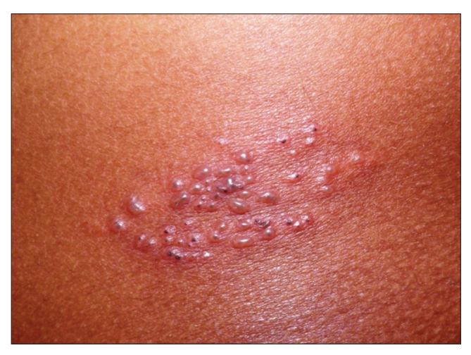
Figure 8: Clear fluid filled multiple grouped vesicles seen over abdomen