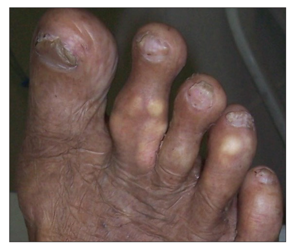
Figure 7: Multiple tophi seen over toes

morphological skin lesions along the lines of minor physical trauma, classically seen in psoriasis and lichen planus. It indicates that disease is very active.