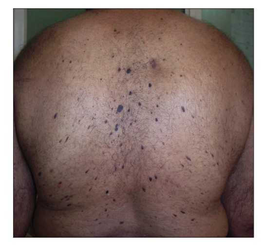
Figure 6: LeserTrelat sign: multiple seborrhiec keratoses seen over back

Acne is a chronic inflammatory disease of the pilosebaceous units. It is characterized by the formation of comedones, erythematous papules and pustules, less frequently by nodules or cysts and, in some cases, is accompanied by scarring. It is frequently