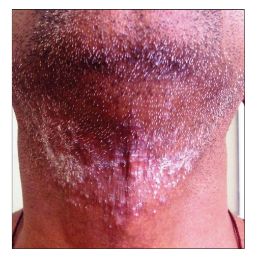
Figure 1: Folliculitis: multiple pustules around hair follicles seen in beard area