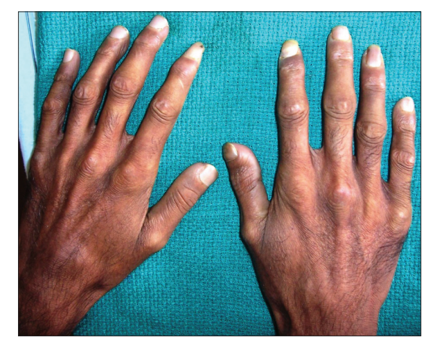
Figure 4: Scleroderma: tapering of fingers (sclerodactily) and hide bound skin seen over fingers

Pseudo lupus vulgaris<sup>[13]</sup> (Syn. Blastomycetic dermatitis, saccharomycosis hominis, pseudoepithelioma with blastomycetes, Gilchrist's disease) is a deep fungal infection caused by Blastomyces dermatitidis . The cutaneous lesions seen in disseminated type are papules, subcutaneous nodules, verrucous plaques mimicking lupus vulgaris.