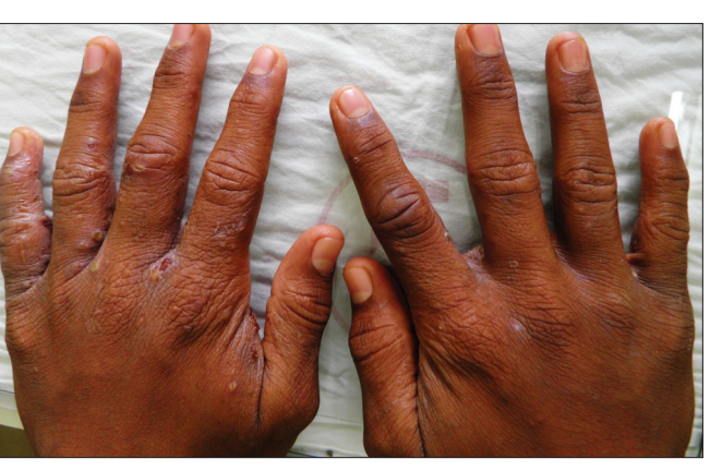
Figure 2: Scabies: multiple vesicles, pustules and papules seen in finger web spaces