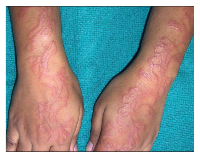
Figure 5: Pseudo-tattoo dermatitis: typical dermatitis seen due to henna over the forearms and hands