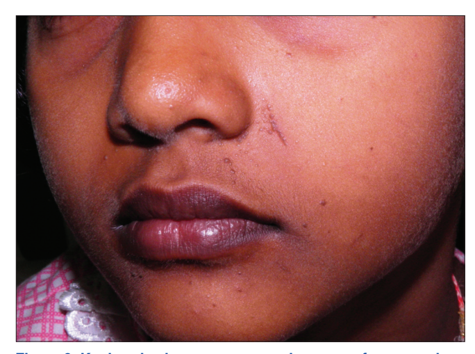
Figure 9: Koebner's phenomenon seen in a case of verruca plana

seen in young adolescents and adults over face, upper chest, upper back and arms.