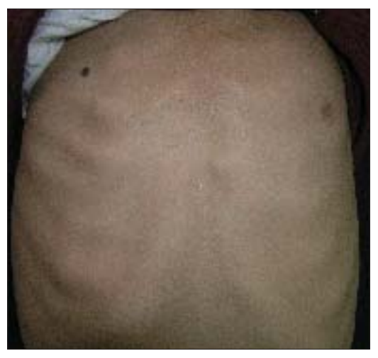
Figure 1: Partial absence (decreased bulk) of right pectoralis major muscle and absence of right breast

A 10-year-old boy presented with complaints of weakness on the right side along with shortening of fingers of the right hand since birth. On cutaneous examination he had decreased muscle bulk (partial absence) of the pectoralis major muscle of the right shoulder girdle and right breast was also absent [Figure 1]. There was shortening of index finger and thumb (brachydactyly) of the right hand [Figure 2]. The dermatoglyphics were also abnormal as seen in Figure 2. Other cutaneous examination was unremarkable except a melanocytic nevus on the upper part of the right side of the chest. Systemic examination was within normal limits. His birth history was unremarkable. Family history of similar anomalies was negative.