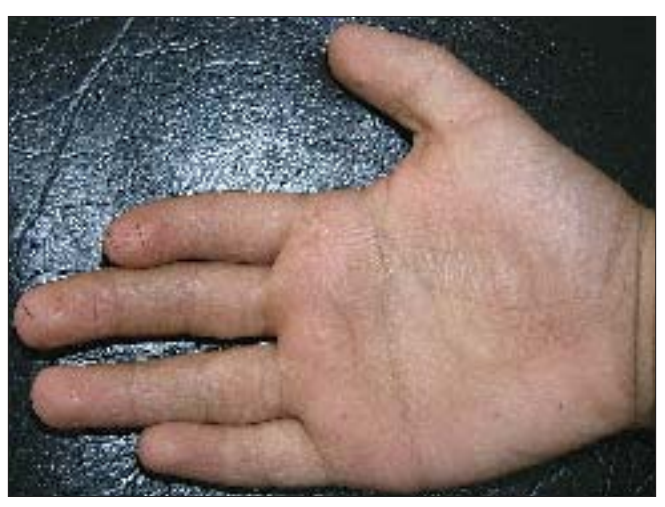
Figure 2: Brachydactyly (index finger and thumb) of the right hand and abnormal dermatoglyphics