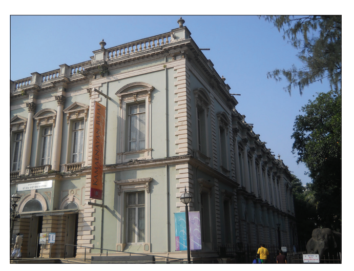
Figure 2: The Bhau Daji Lad Museum, Mumbai

As already mentioned, India suffered from the curse of leprosy since its early days. The use of various herbs is mentioned in the ancient Ayurvedic texts long before Christian era. Bhau Daji's intense interest in the Indian system of medicine and profound knowledge of Sanskrit and other ancient Indian languages made him search for remedies of diseases within the indigenous system. He had a great collection of old manuscripts written in Sanskrit, Arabic, and Pali.