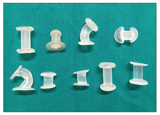
Figure 3: Different molds prepared from a glue stick