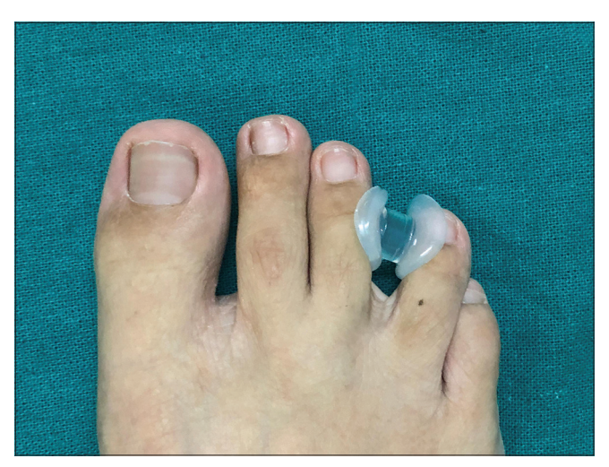
Figure 2: Glue stick mould in use by a patient